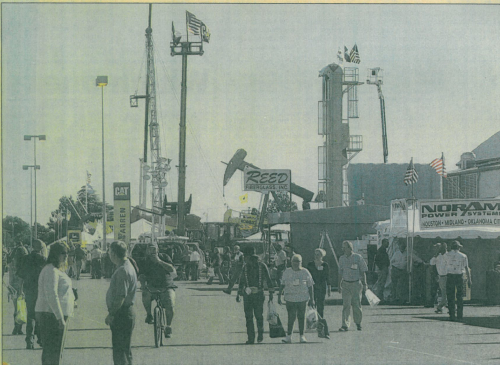
Crowds start to form Tuesday morning at the Permian Basin International Oil Show shortly after the opening ceremony. This year's show continues through Thursday and is only open to registered guests.